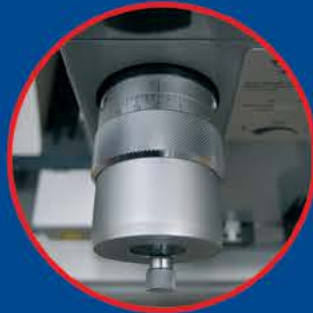
Kocher & Beck Gapmaster anvil adjust