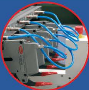
Crush slitting module with 5 holders