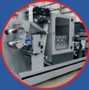
Semi-automatic turret rewinder