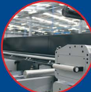
Optional rail mounting system