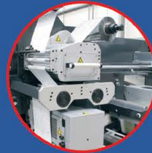
Flat bed hot foil with foil saver