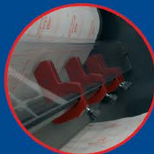
Razor slitting module with 5 holders