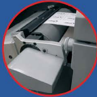
Chill roller option