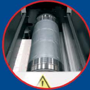
Semi-rotary die station with full rotary option