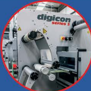
Web advance option for fast changeover of rolls