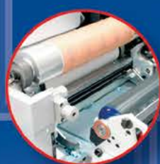
b Cassette slides away from print head