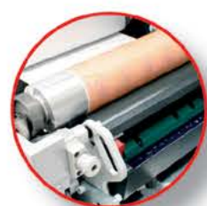
a Quick change flexo head