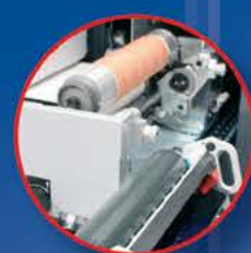
c Slides out towards operator for removal