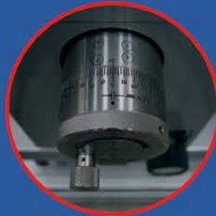
Rotometrics ACA anvil adjust